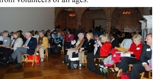
eers receiving awards in Greystone Mansion Living Room