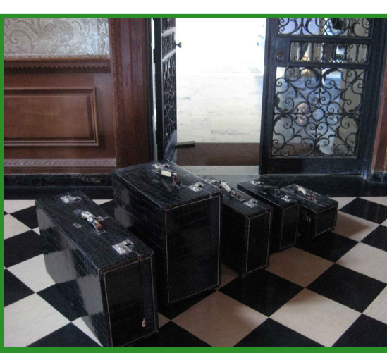
Black leather luggage set at front door of Greystone

The Friends of Greystone are honored to preserve, archive and display in our ever growing collection these keepsakes of a family and these mementos of a time gone by.