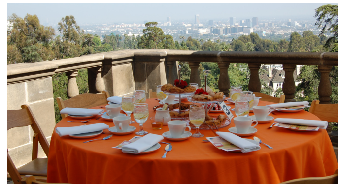
Tea on the Terrace