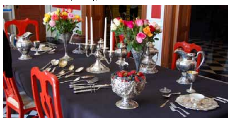
The Doheny "sterling silver" tabletop on loan for exhibit. Holloware - Black, Starr & Frost. Flatware - Wallace pattern "R Wallace"