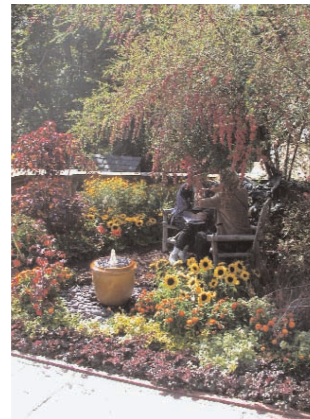
Greystone Park is located at 905 Loma Vista Drive, Beverly Hills, CA 90210. For more information, visit greystonemansion.org .

Clockwise: Elegant flowers are just as beautiful as sculptures or fountains. Used as a centerpiece, the base serves as a platform for an organic work of art. • Don't invest in expensive fixtures for your garden. Rustic skeletal furniture is an easy thrift find that will work for your budget, and fit in with the style of an English countryside. • A raised view of the Greystone garden shows the structure and layout of the landscape. • A cozy sitting area in the garden allows you to relax and appreciate wildlife and nature. Even as simple as two antique chairs, having a shady nook is essential. • This rectangular pond is perfect for the symmetrically shaped garden. Complementing the home, the landscape is beautiful, clean and well structured.