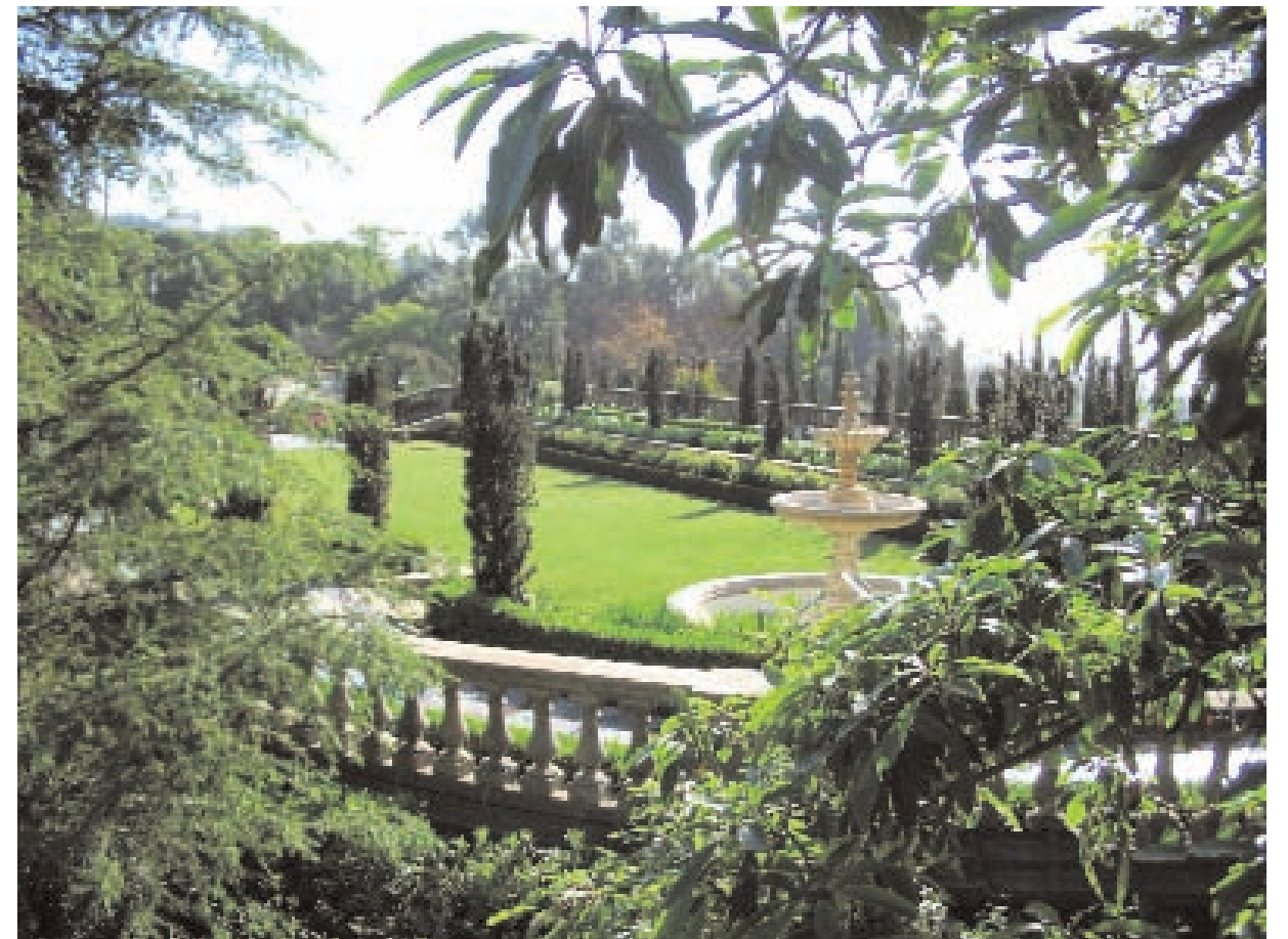
One of Los Angeles' historic sites, the 429-acre ranch overlooks the city.

Locals and day-trippers unwind at the garden, which is styled with Italian and English accents, and surrounded by tiered fountains and white roses. Overlooking the city, it exudes romance with the classic style of an Italian villa.