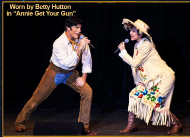
Worn by Betty Hutton in "Annie Get Your Gun"